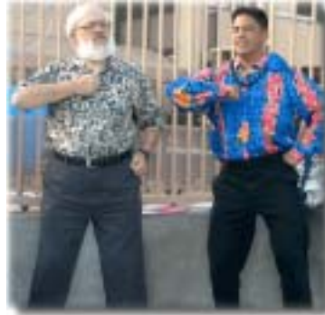
Haas and Kahaku continue their mentoring session.